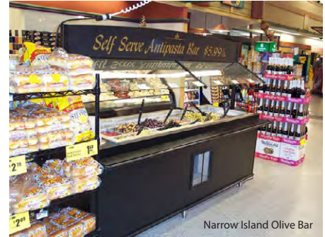
Narrow Island Olive Bar