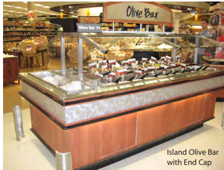
Island Olive Bar with End Cap