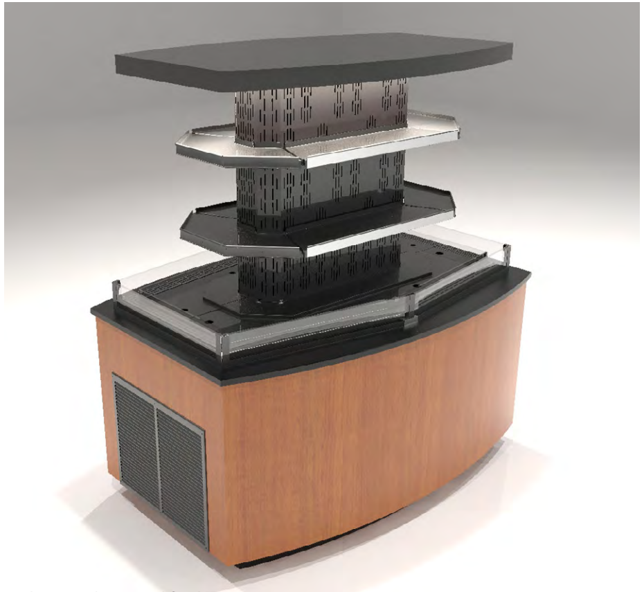
Shown with optional finishes