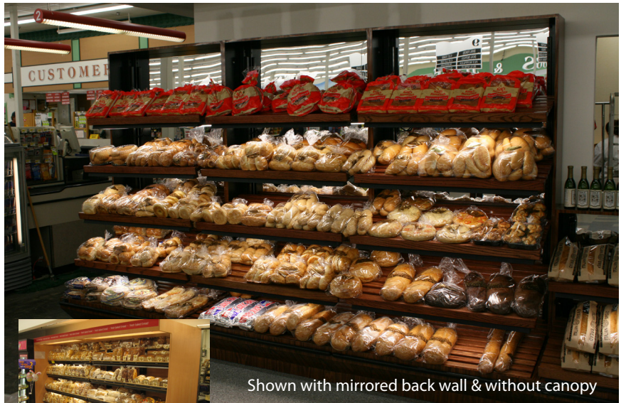
Shown with mirrored back wall & without canopy