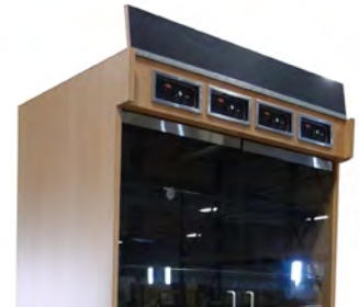
Easy access to warmer controls under lift-up front panel.