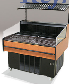
Refrigerated Mobile (Low Profile) (available in 2 standard heights and 3 lengths)