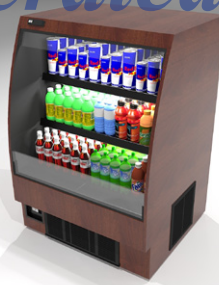
Refrigerated Grab-n-Go (available in 2 standard heights/3 lengths)