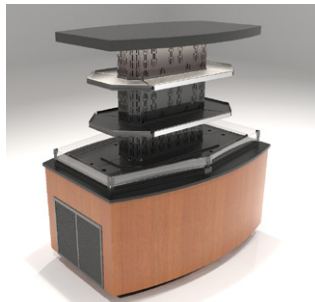
Refrigerated Island (available in 3 standard lengths)