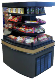
Refrigerated End Cap (available in 3 standard lengths)